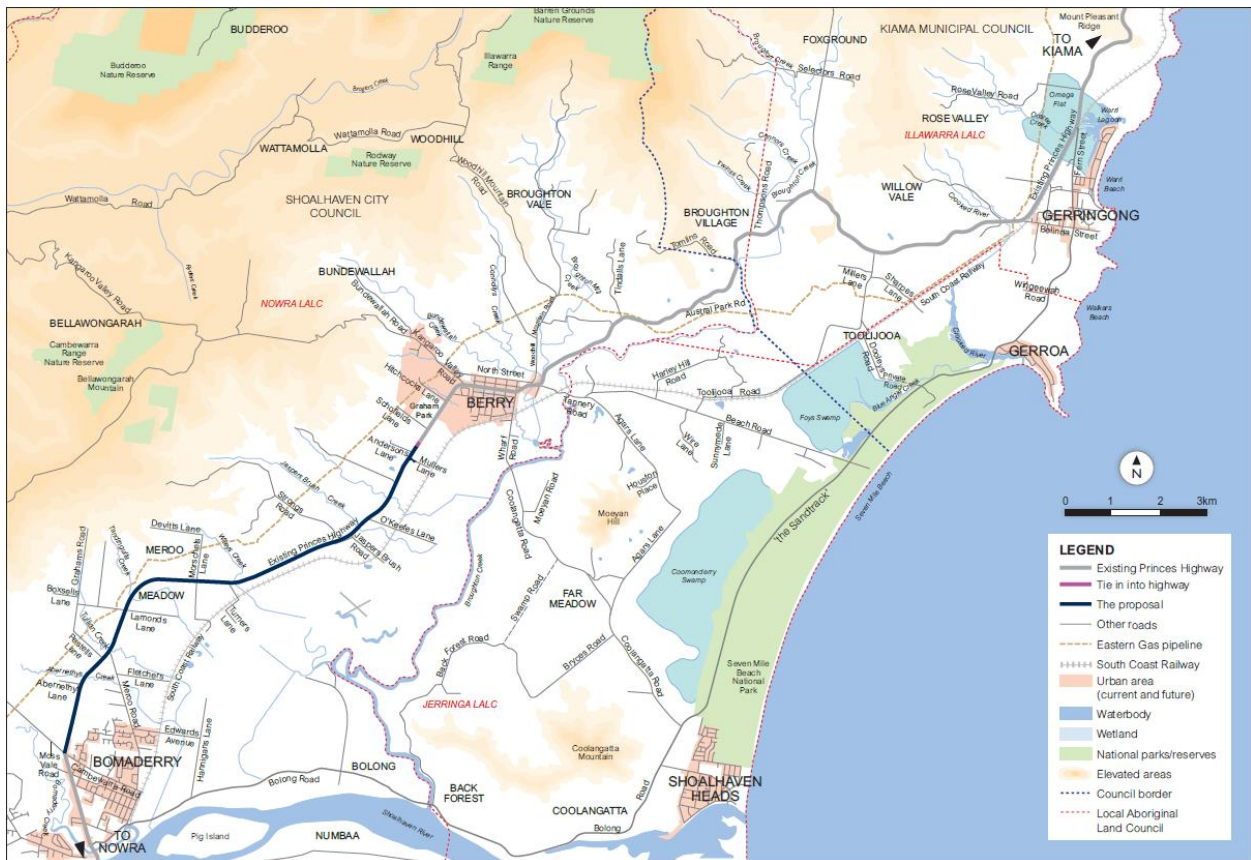
Figure 1-1 Project location

Figure 1 provides an overview of the project location.